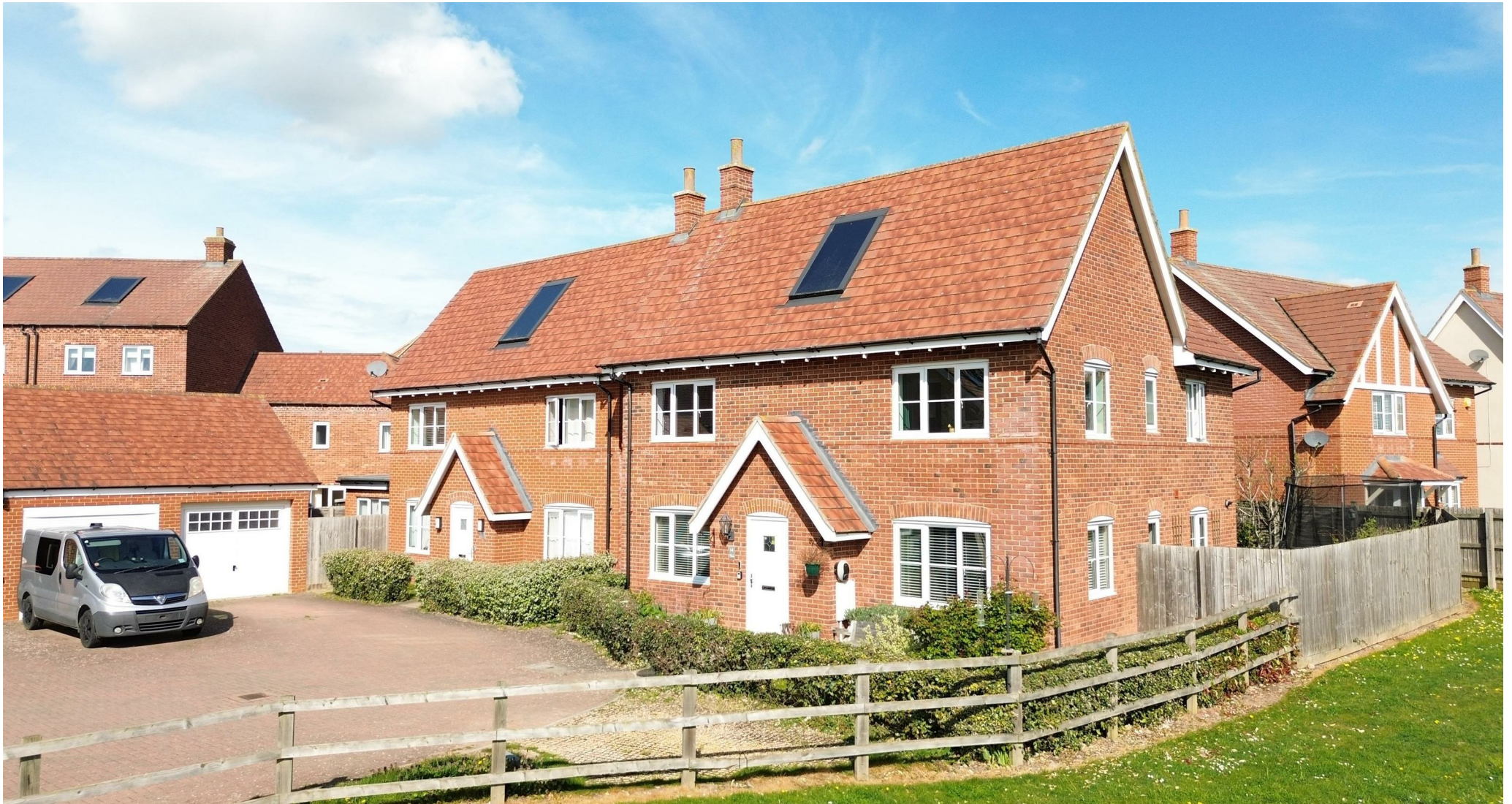
Wortham Close, Great Denham, Bedford, MK40 4RU Guide price £500,000 Freehold