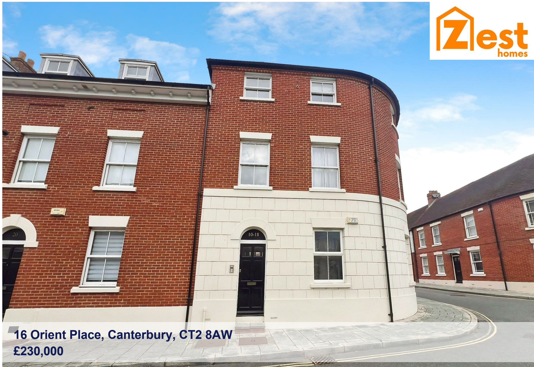
16 Orient Place, Canterbury, CT2 8AW £230,000