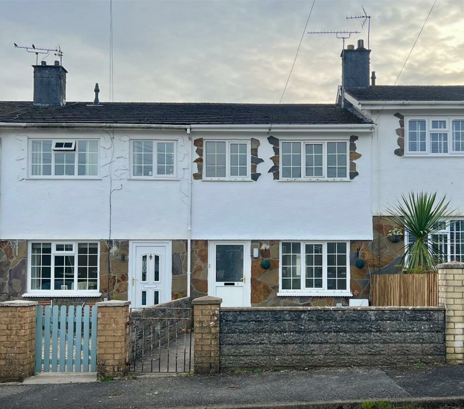
3, Taliesin Close Bridgend, CF35 6JR