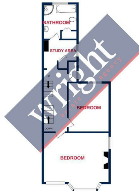
1ST FLOOR 666 sq.ft. (61.9 sq.m.) approx.