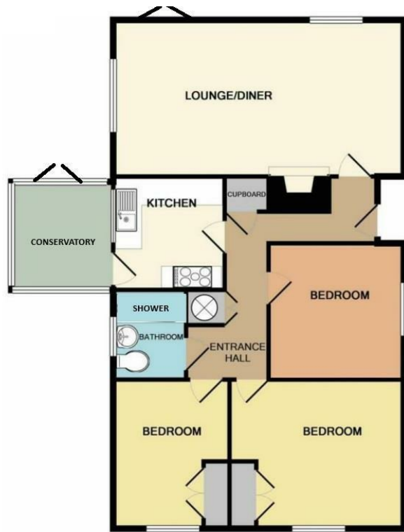
TOTAL APPROX. FLOOR AREA 81.4 SQ.M. (876 SQ.FT.)