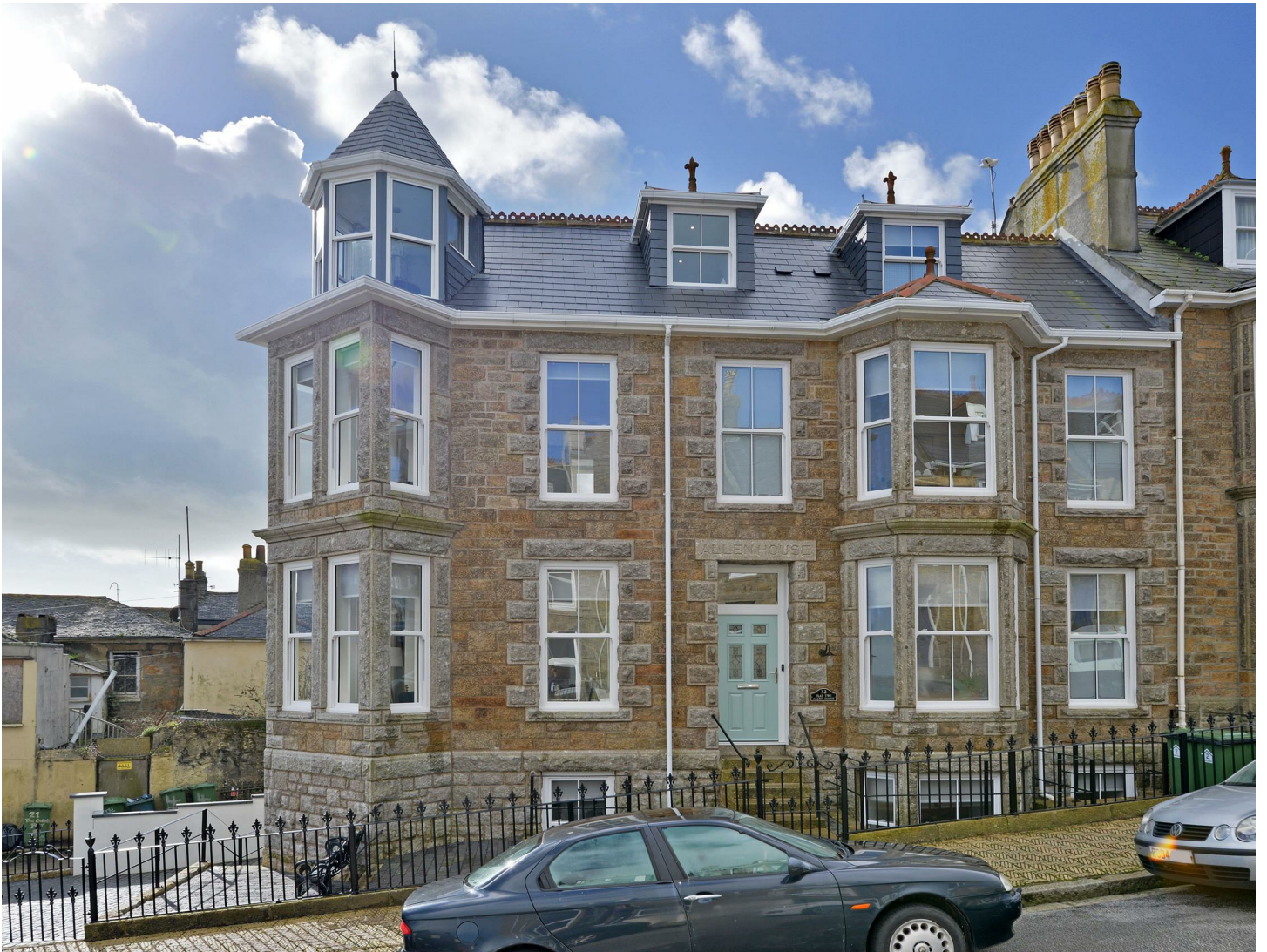
2 Allen House