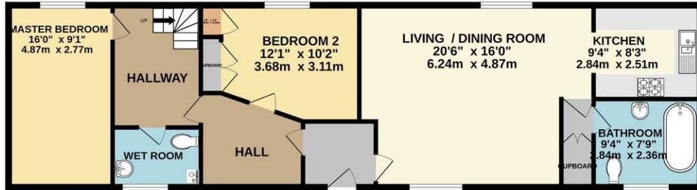
GROUND FLOOR 966 sq.ft. (89.7 sq.m.) approx.