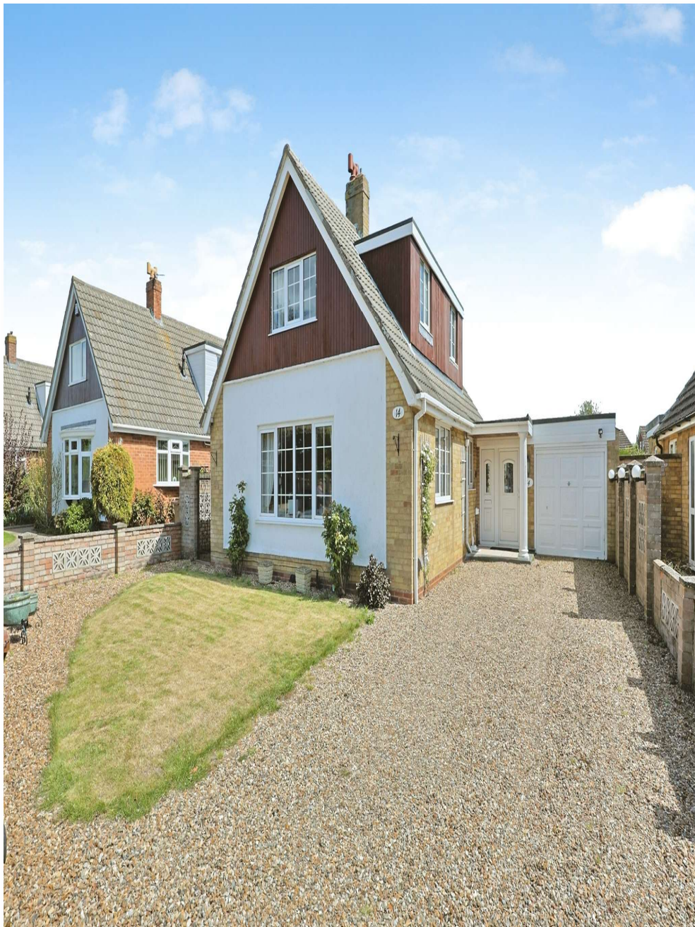
Hewitts Lane, Wymondham NR18 0LS