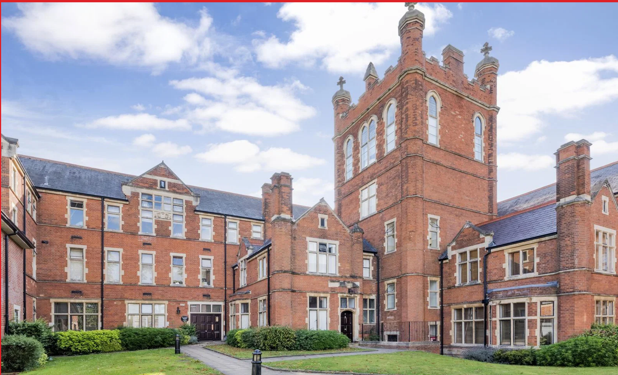
Flat 9, Windsor House, King Edward Place Bushey