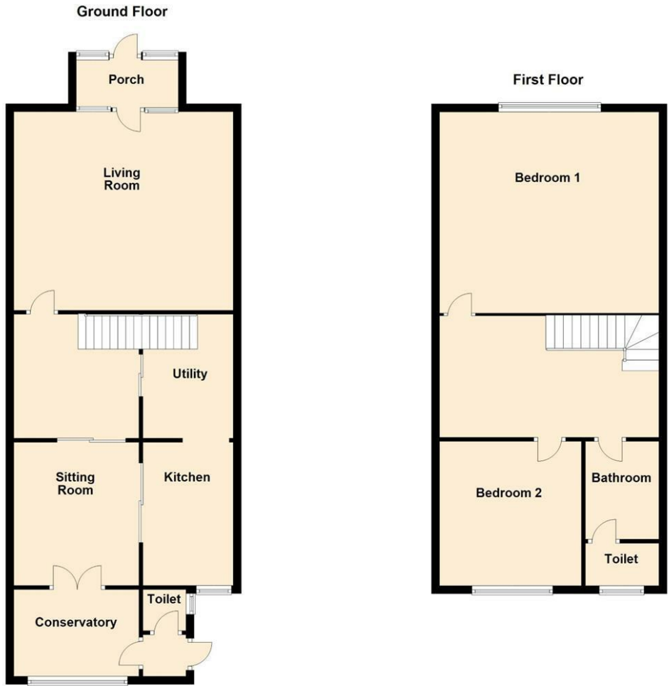
SKETCH PLAN FOR ILLUSTRATIVE PURPOSES ONLY All measurements are approximate. Plan produced using PlanUp.