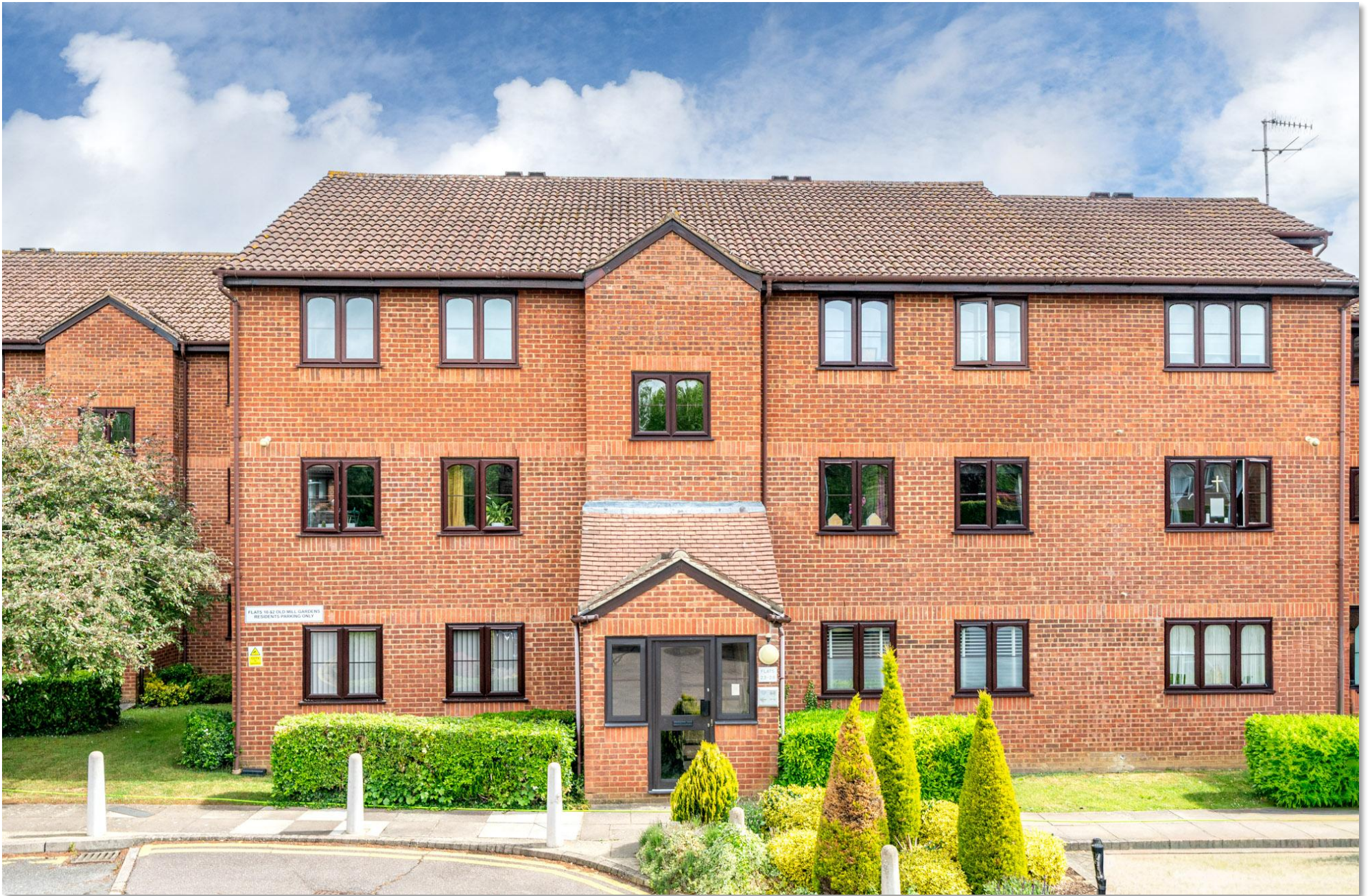
Old Mill Gardens, BERKHAMSTED HP4 2NZ