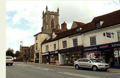
St Andrews Church

Cognatum Property Limited, Pipe House, Lupton Road, Wallingford, Oxfordshire OX10 9BS