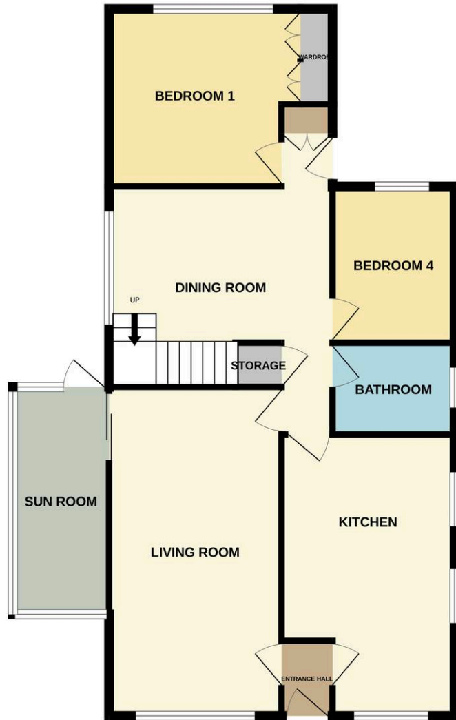
GROUND FLOOR 905 sq.ft. (84.1 sq.m.) approx.