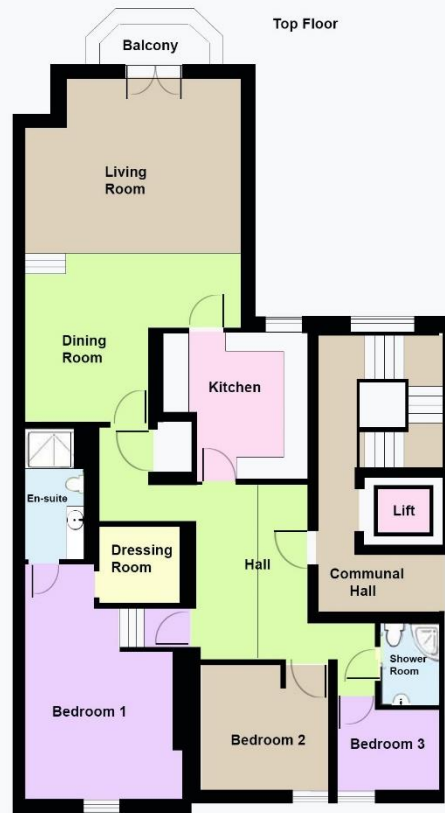
23 Royal Court Apartments

This floor plan is not drawn to scale and is for illustration purposes only