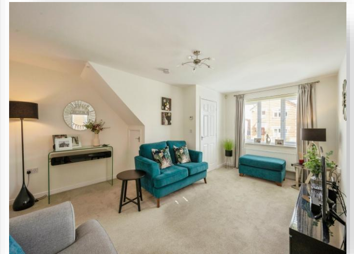
West Moor Croft, Goldthorpe Rotherham S63 9FL