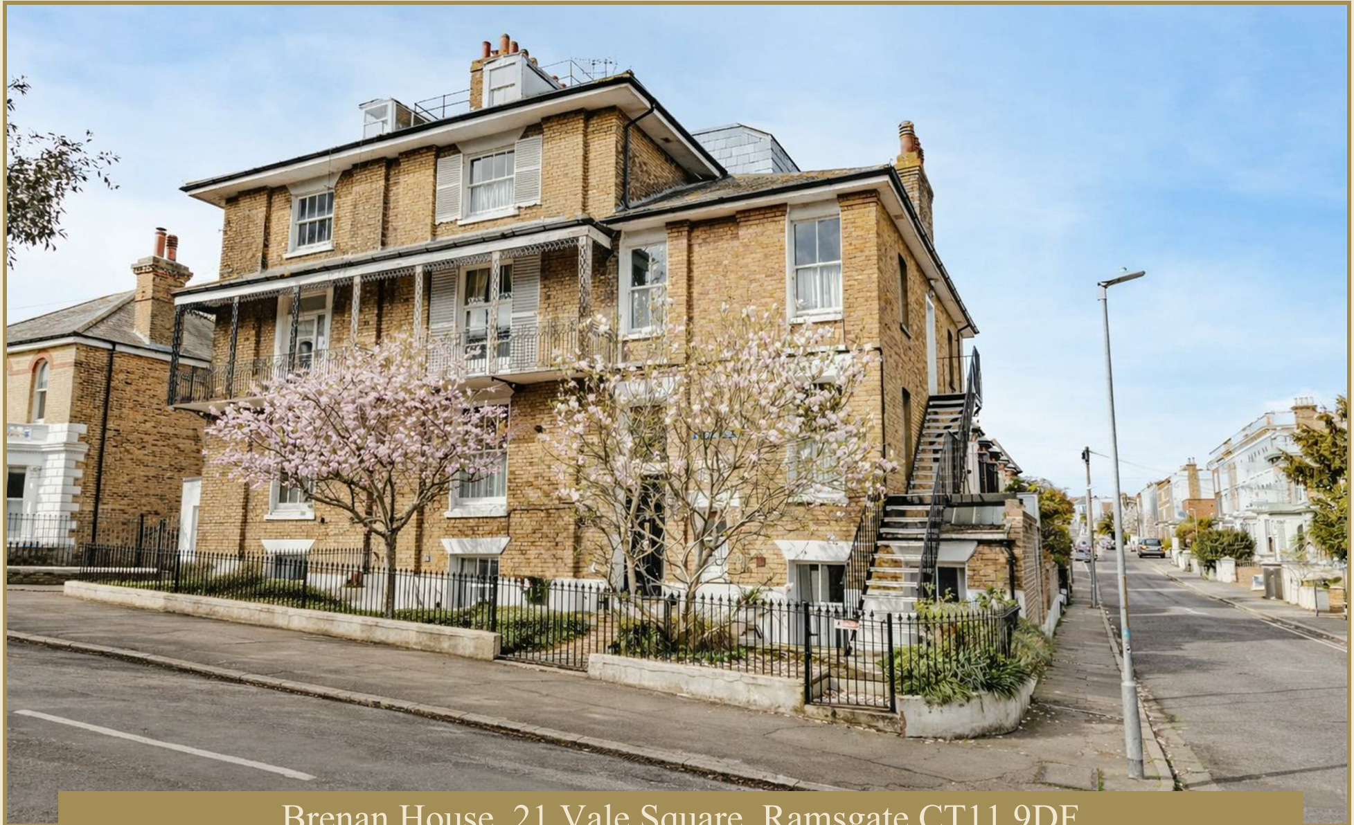
Brenan House, 21 Vale Square, Ramsgate CT11 9DF