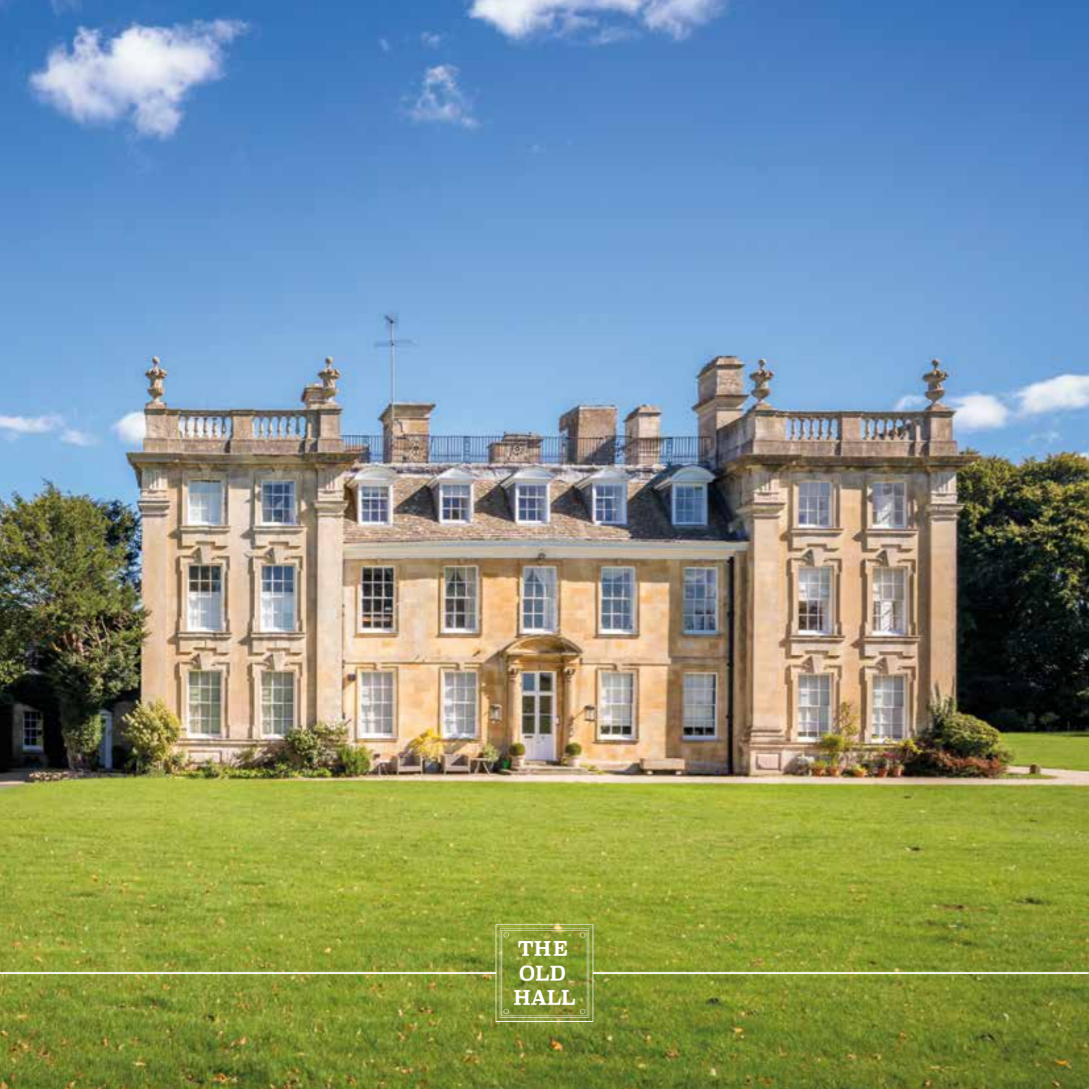
THE OLD HALL