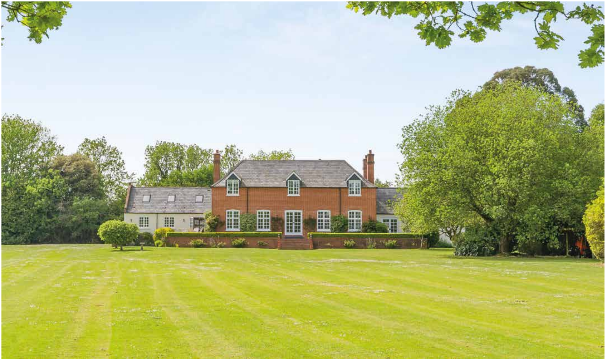
Coach House Itton | Chepstow | Gwent | NP16 6BP