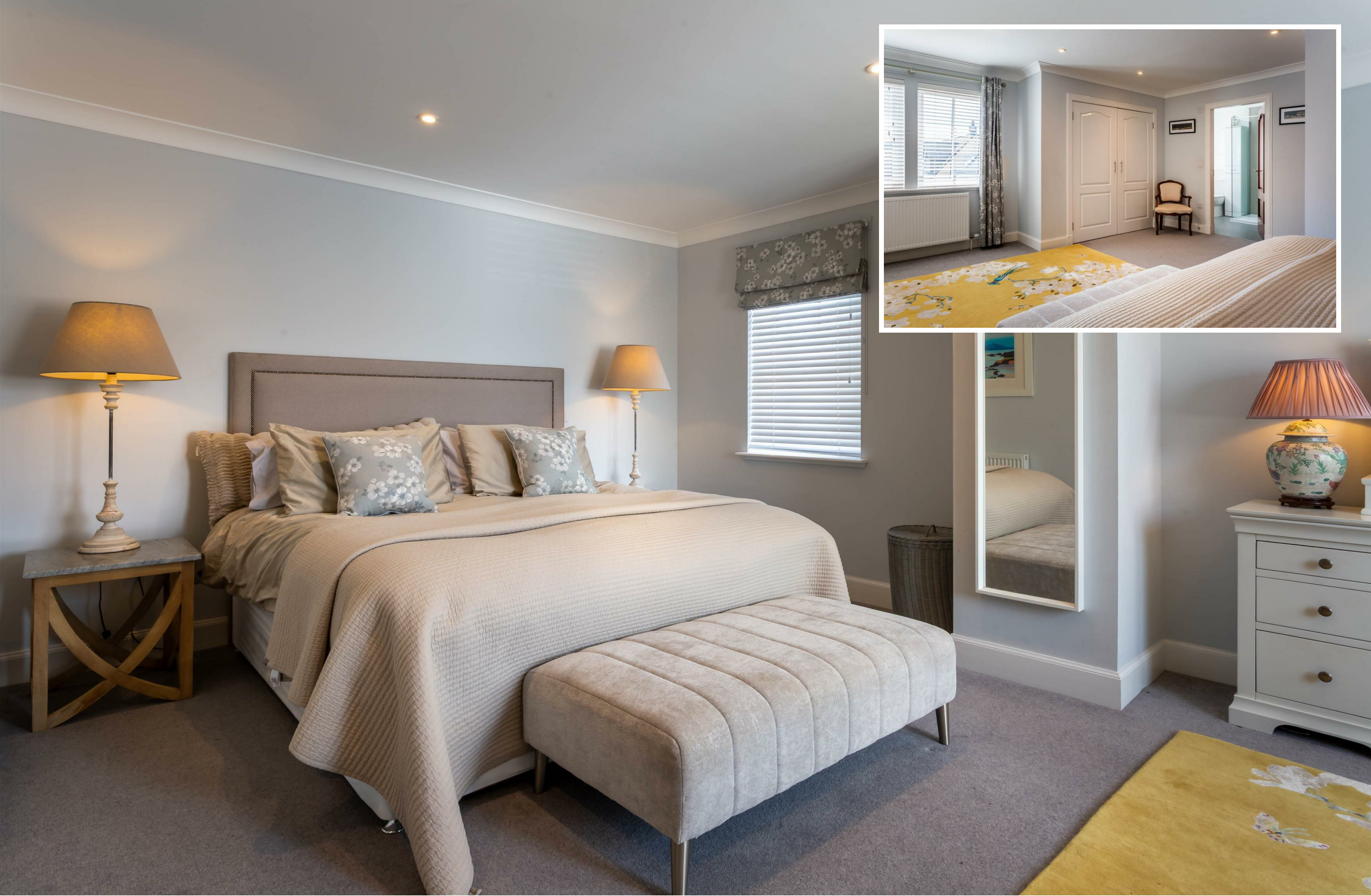
16 Kinloch Court (inc Ardura Cabin and garden cabin), Blackwaterfoot, Isle Of Arran, KA27 8EF