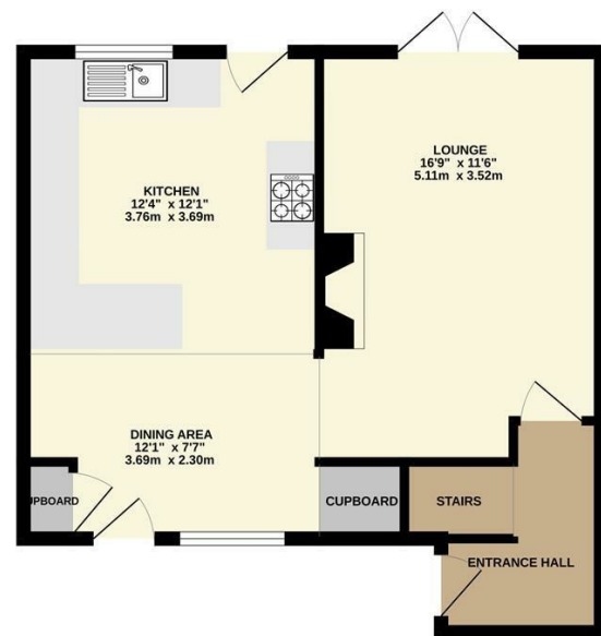
GROUND FLOOR 487 sq.ft. (45.3 sq.m.) approx.