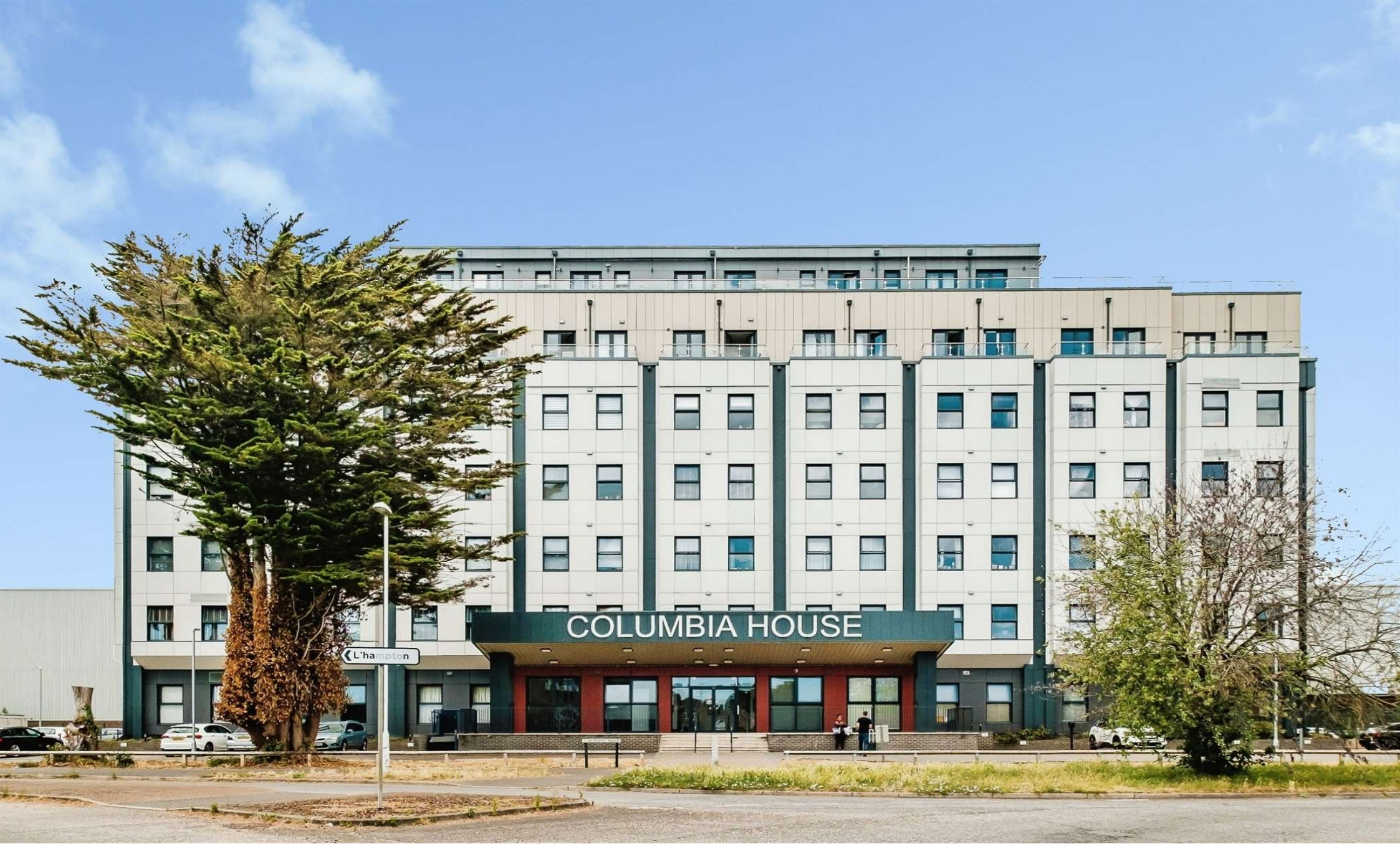
Columbia House Romany Road, Worthing BN13 3YR