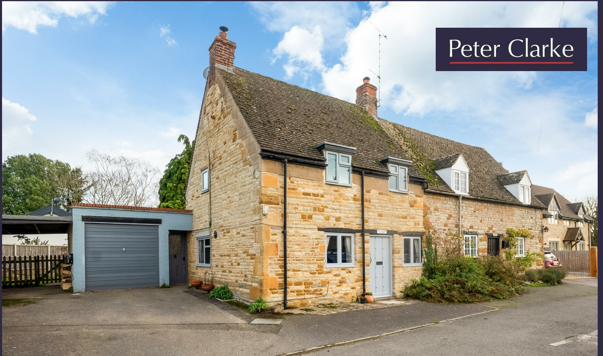
Old Grange Cottage, Blackwell, Shipston-on-Stour, CV36 4PE