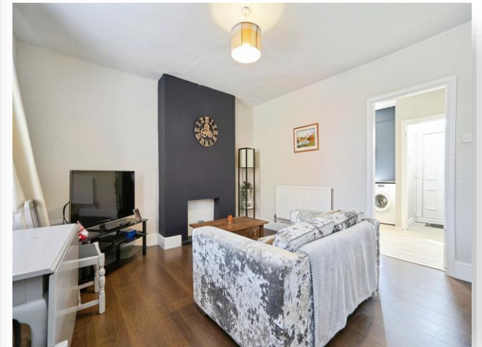
Dockfield Road, Shipley BD17 7AD