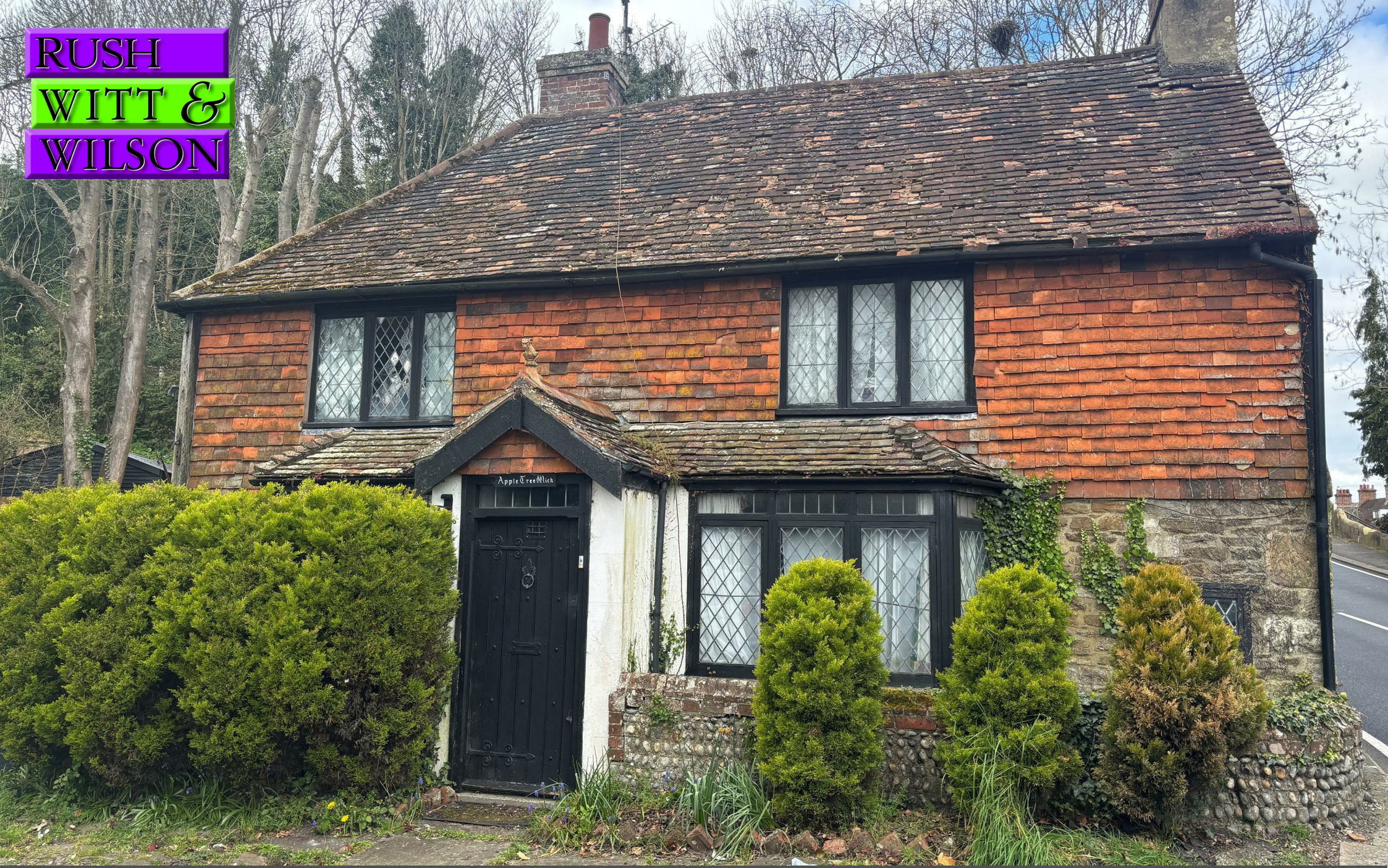
The Strand, Winchelsea, East Sussex TN36 4JT Guide Price £450,000 Freehold