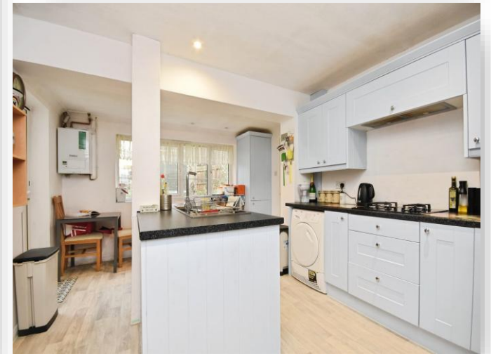
Augustus Close, HAVERHILL, CB9 0NJ