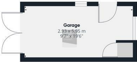
Ground floor Building 2