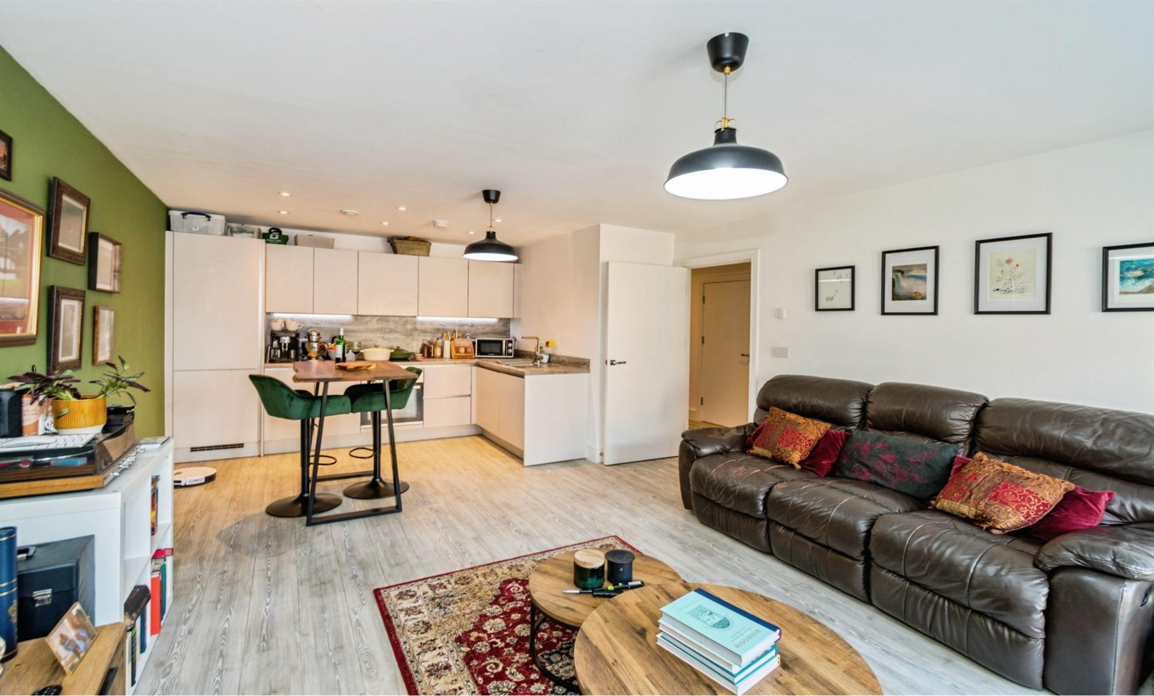
Television House, Meridian Way, Southampton SO14 0FS