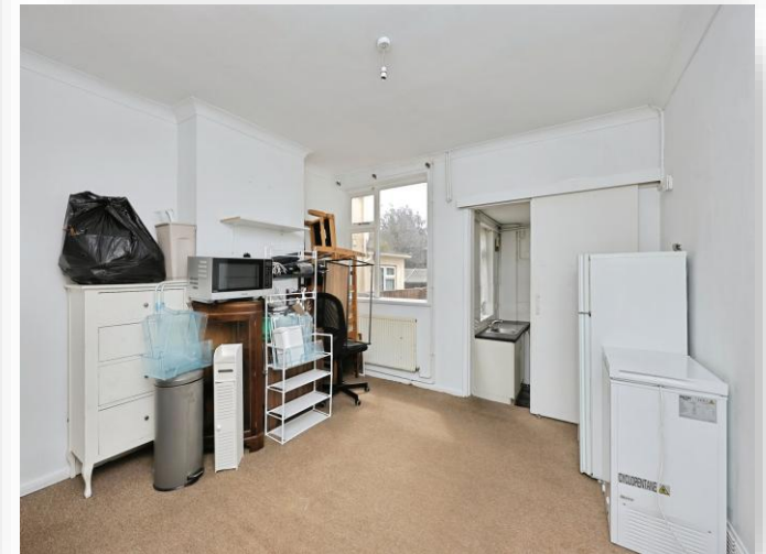
Albany Road, Norwich, NR3 1EE