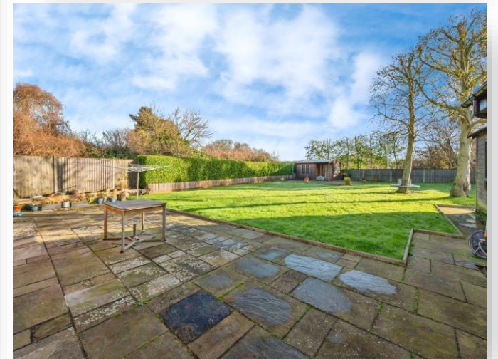
Rustic Bungalow, Heath Road, Hickling, Norwich, NR12 0YH