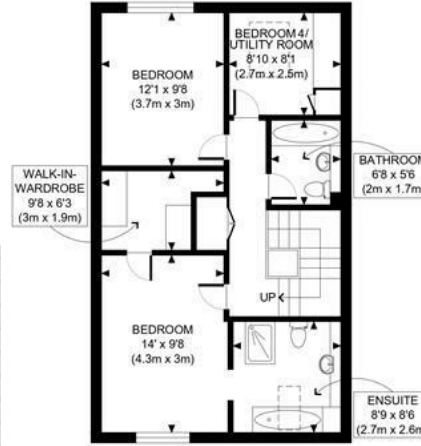
SECOND FLOOR GROSS INTERNAL FLOOR AREA 627 SQ FT