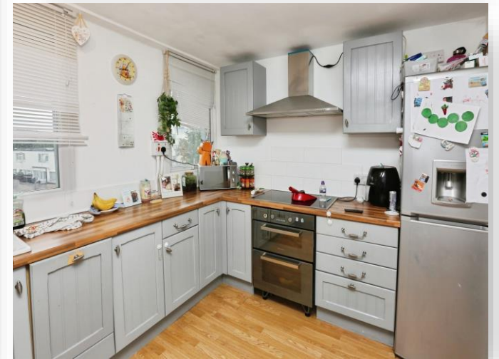
Williams Close, Gosport PO13 9QR