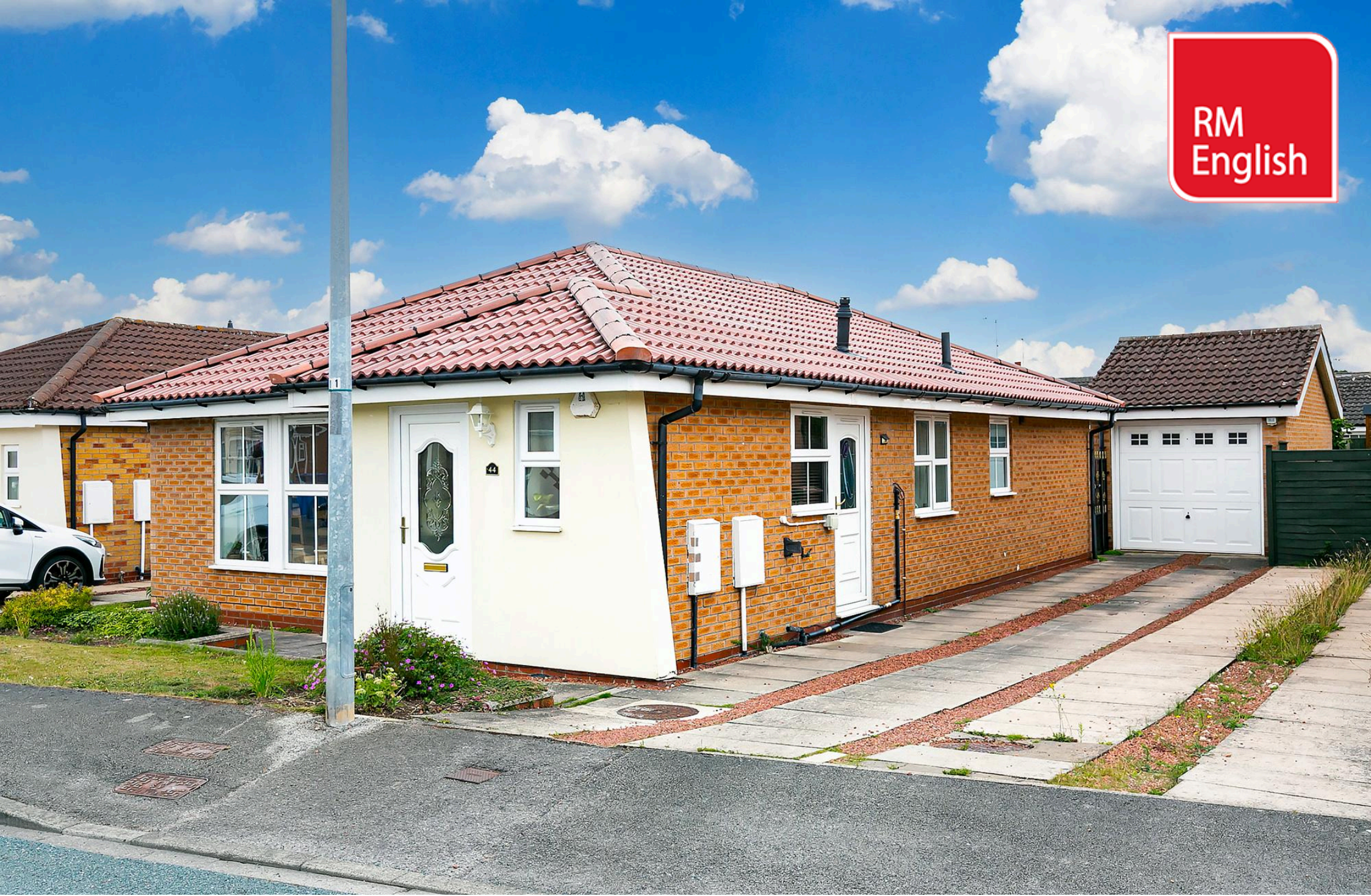
Moorfield Way, Wilberfoss, York, North Yorkshire, YO41 5PL