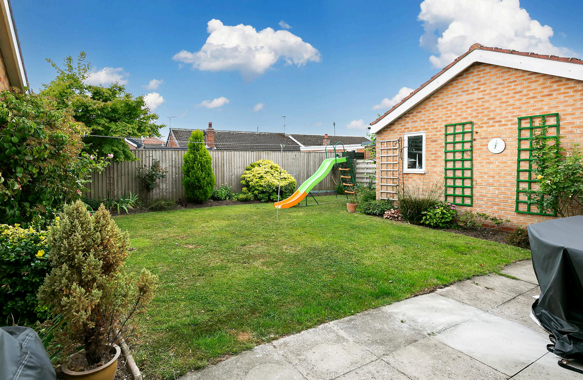
AN ATTRACTIVE THREE BEDROOM DETACHED BUNGALOW WITH NO ONWARD CHAIN