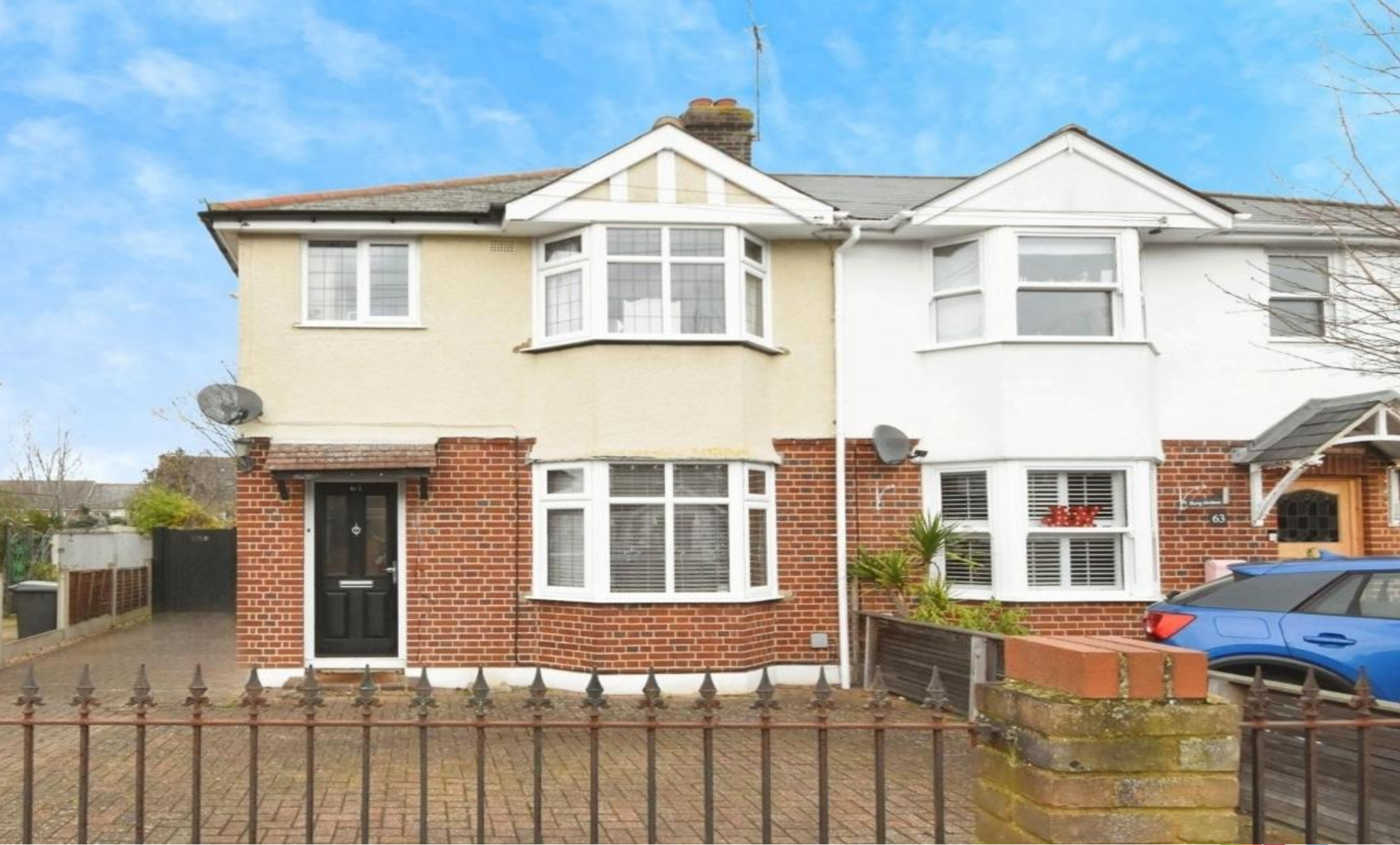
Baddow Hall Crescent, Great Baddow Chelmsford CM2 7BX