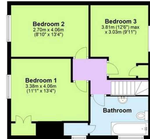
First Floor Approx. 48.0 sq. metres (516.1 sq. feet)

None of these statements contained in these particulars are to be relied upon as statements or representations of fact. These particulars are not an offer or contract or part of one. Floor plans are provided for guidance as to the layout of the property only. Room sizes and measurements are approximate only. Please note we have not tested the equipment, appliances and services in the property and interested parties are advised to commission appropriate investigation before formulating their offer for purchase. Sunderland's are a member of the 'Ombudsman for Estate Agents Scheme' OEA and therefore adhere to their Code of Practice. A copy of the Code of Practice is available on request.