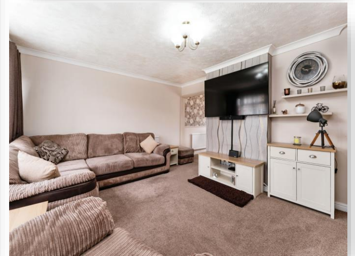
Meadow Court, Littleport CB6 1JW