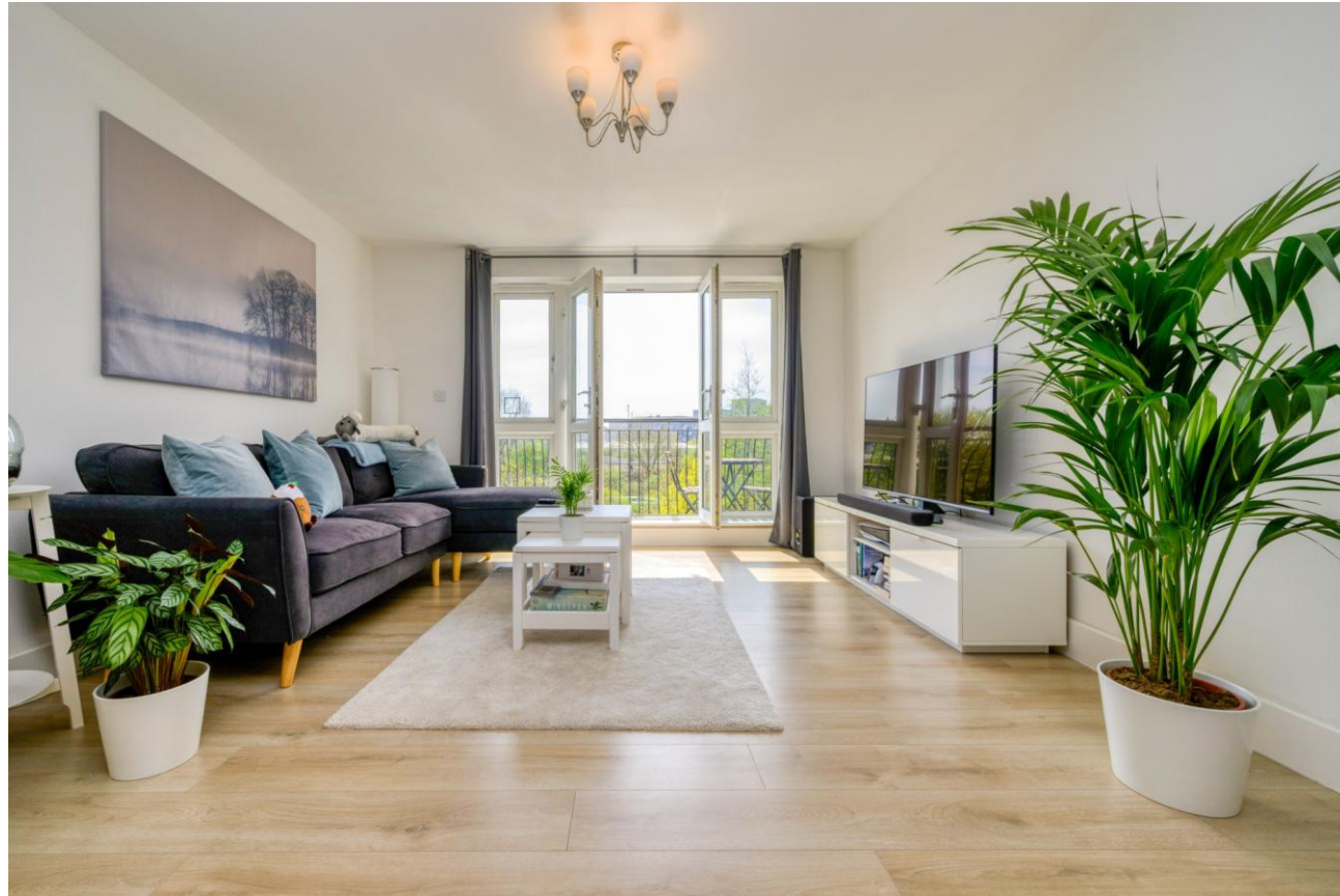
44 Luscinia View, Napier Road, Reading, RG1 8AB O.I.E.O. £270,000 Leasehold

Masons are proud to offer to the market this immaculately presented 2 bedroom second floor apartment situated in a popular development within walking distance of The River Thames, Reading Town Centre and mainline station. Close to a plethora of local amenities, the property has undergone recent improvements by the current owner including a full redecoration and new flooring. The spacious accommodation comprises of a 23ft open plan kitchen/living/dining room with access to the balcony overlooking Reading Town Centre, a 13ft master bedroom with en-suite shower room, an 11ft second bedroom and a family bathroom. Further benefits of the property include a lease length of 134 years, allocated parking, UPVC double glazing, lift access and a secure entry system. VIEWING RECOMMENDED.