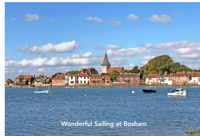
Wonderful Sailing at Bosham

LOCAL AUTHORITY: Chichester Council 01243 78516