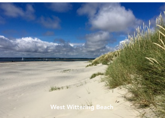
West Wittering Beach