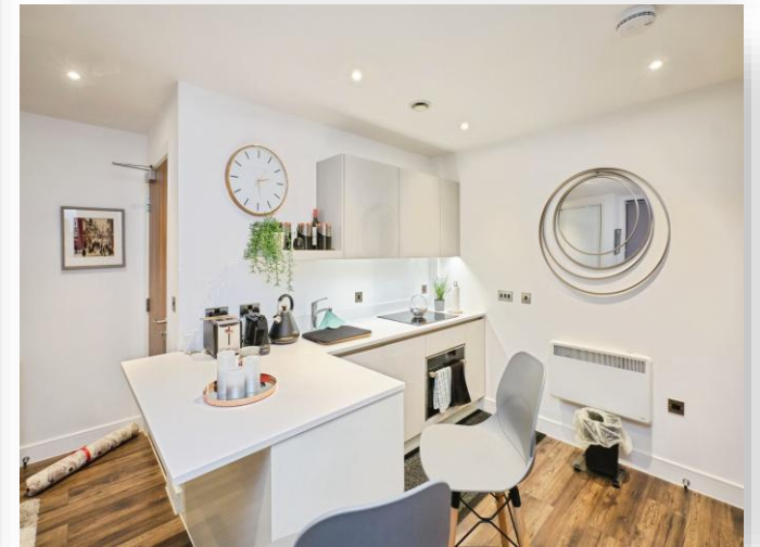
Copperbox High Street, Harborne BIRMINGHAM B17 9BF