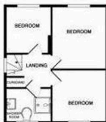
1ST FLOOR APPROX FLOOR AREA 374 SQ.FT (44.7 SQ.M.)

TOTAL APPROX FLOOR AREA 1086 SQ.FT. (101.8 SQ.M.)