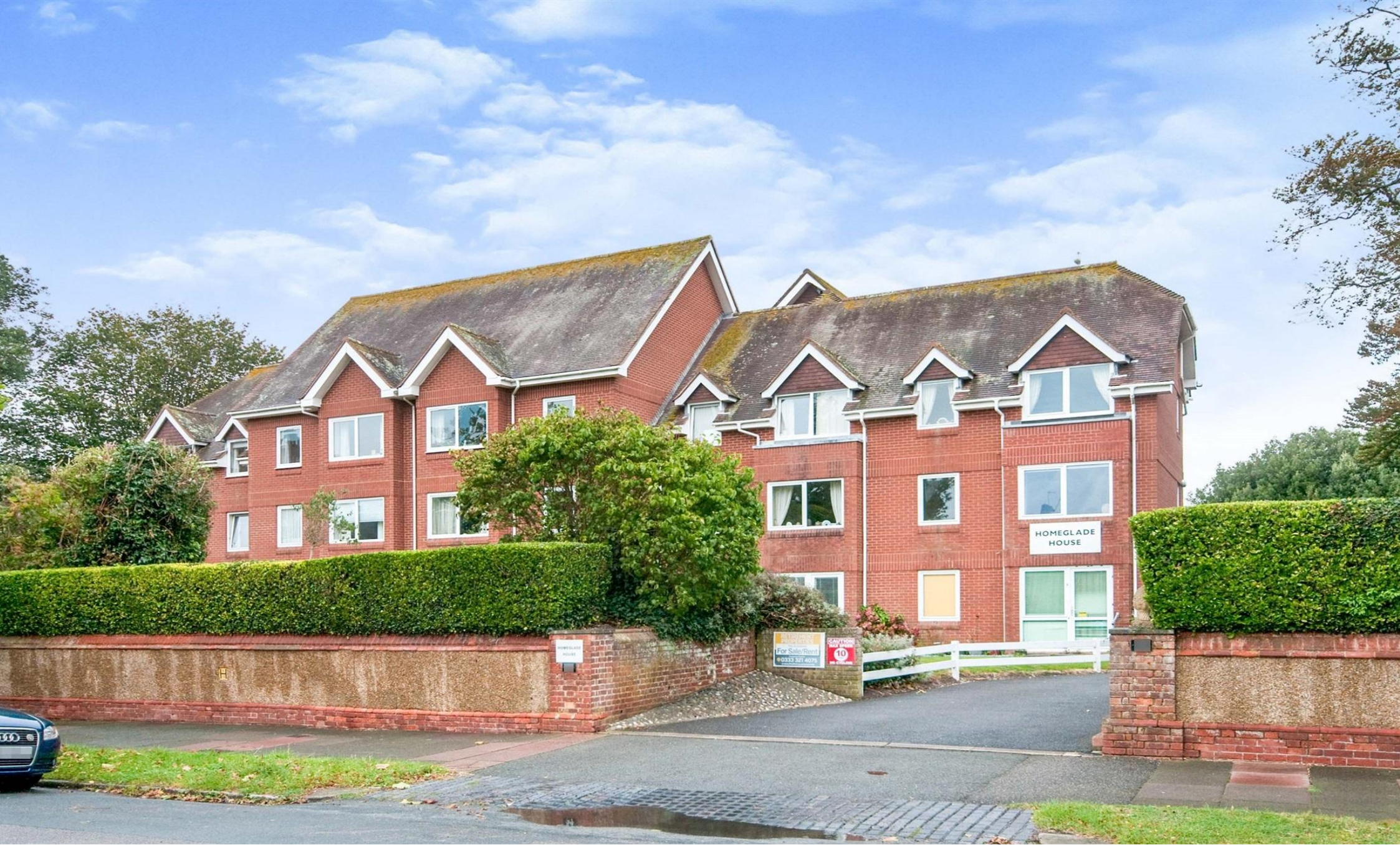
Homeglade House St. Johns Road, Eastbourne BN20 7PZ