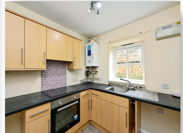
Lynn Road, Downham Market, PE38 9NN