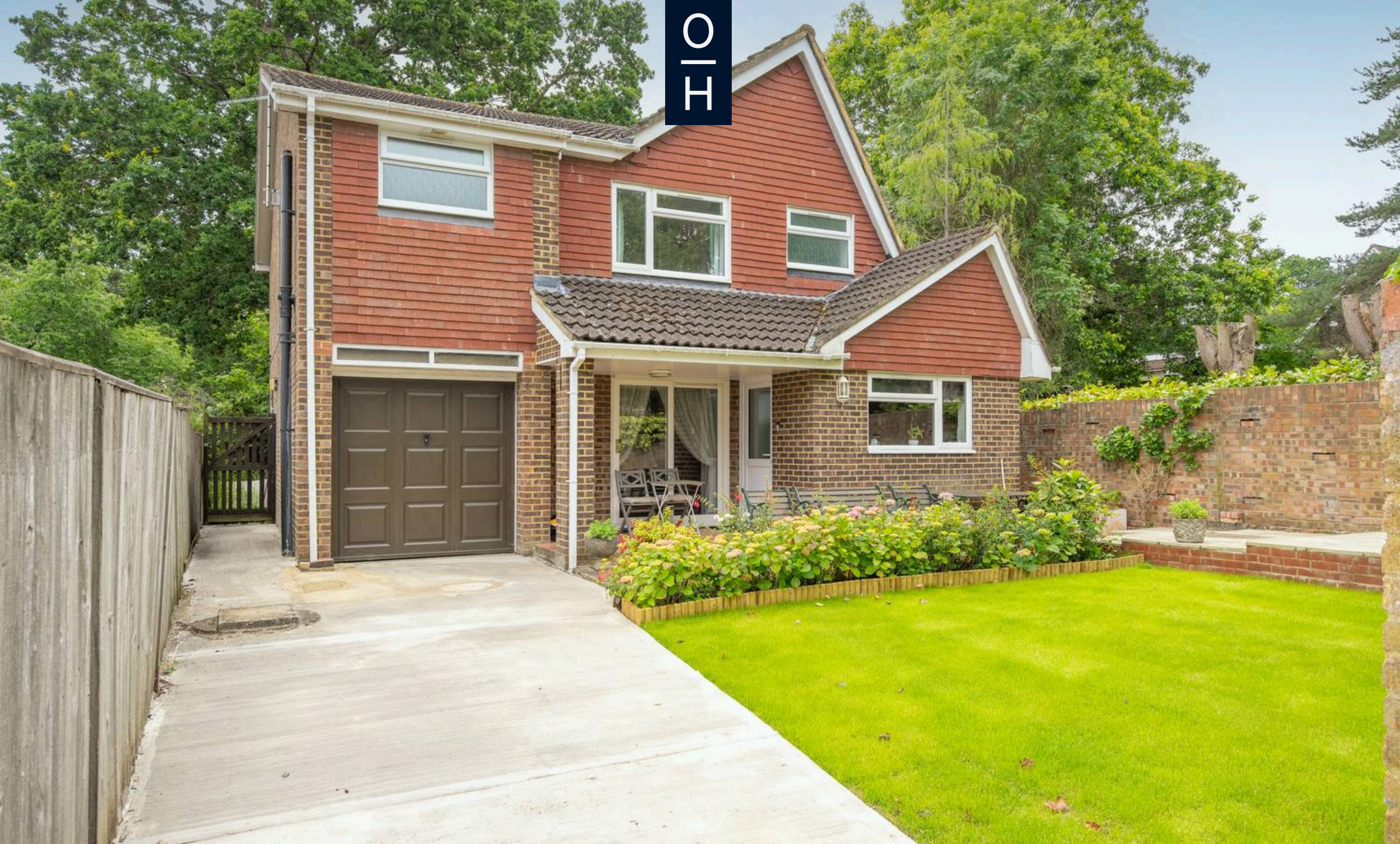
Franklyn Crescent, Windsor £700,000