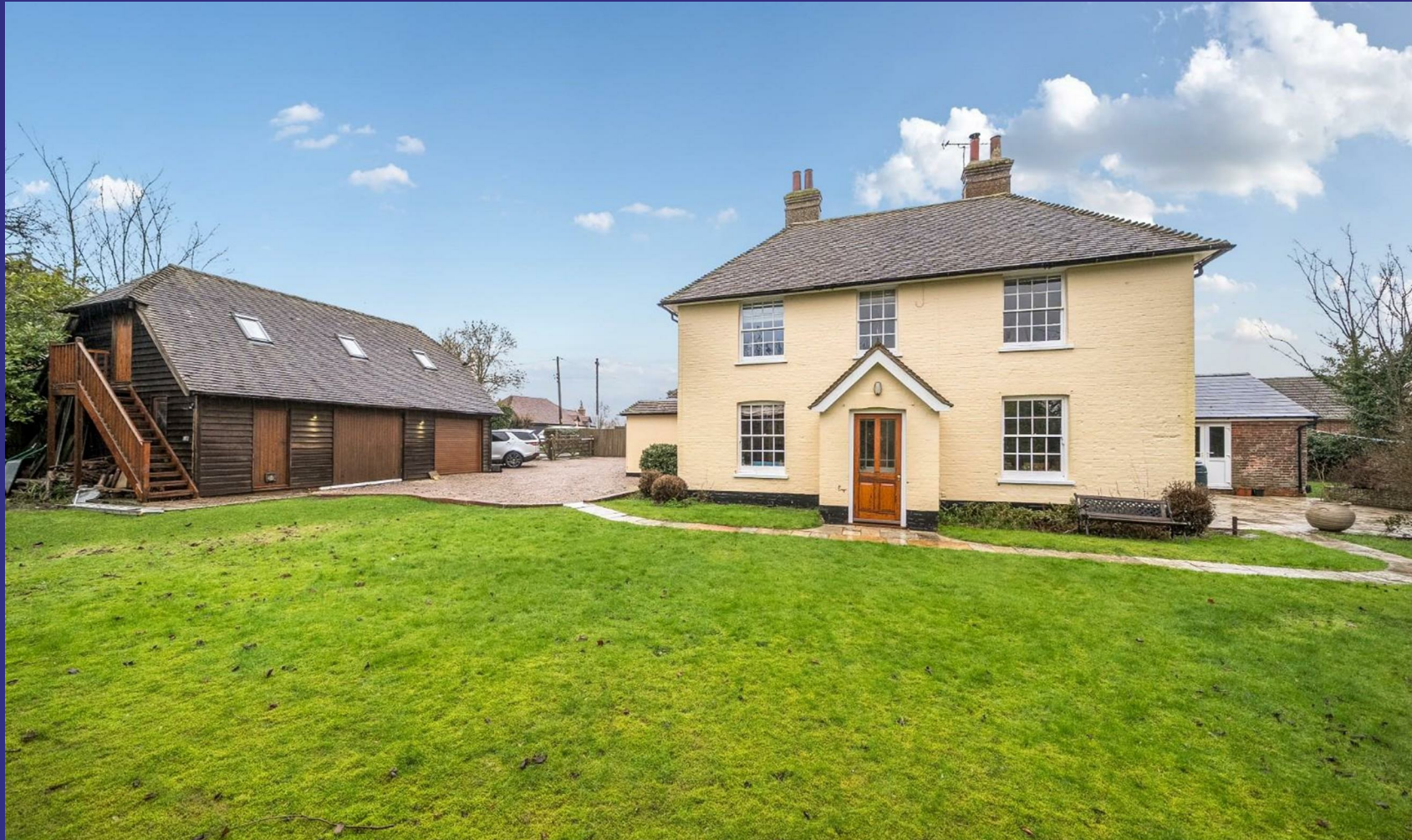
Lees Road Ashford