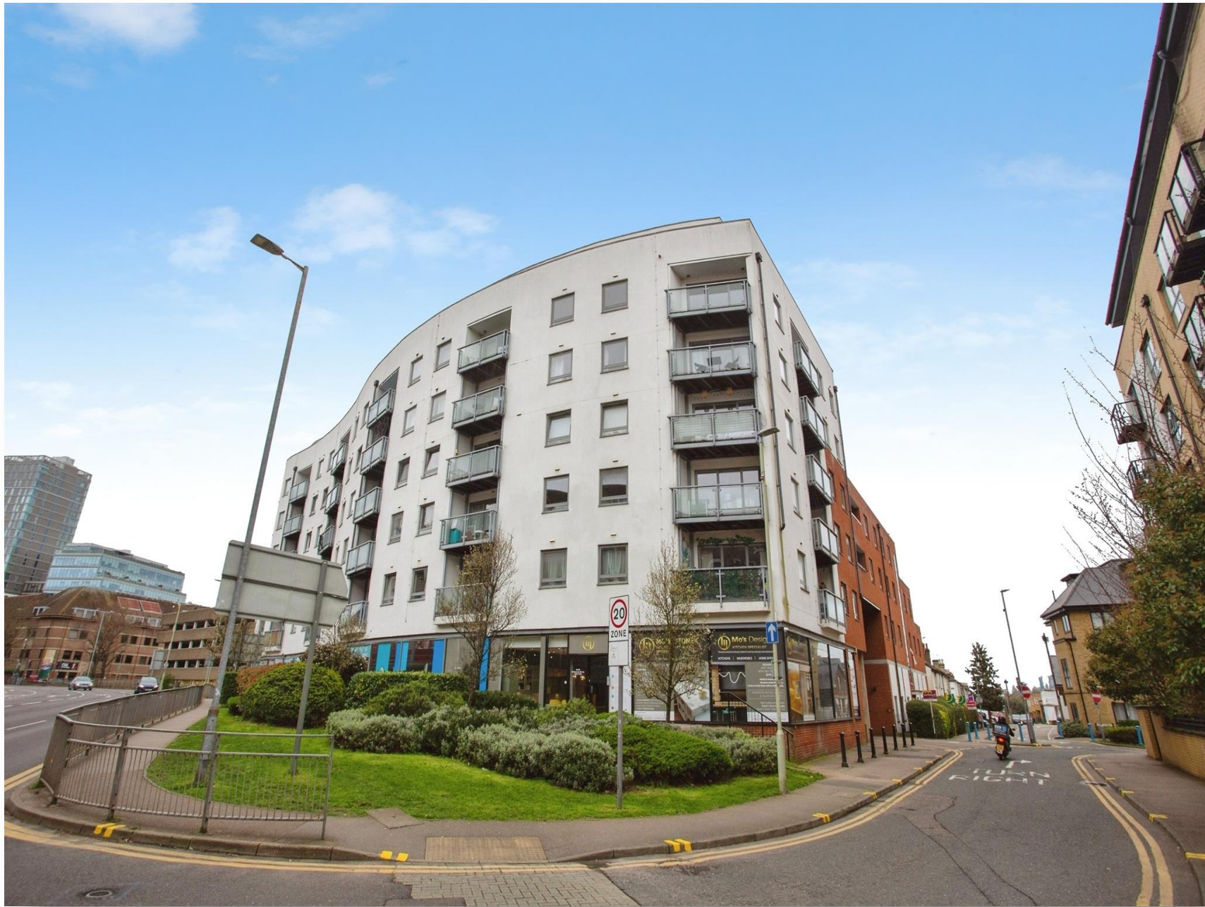
Ashleigh Court, Loates Lane, Watford, WD17 2PJ