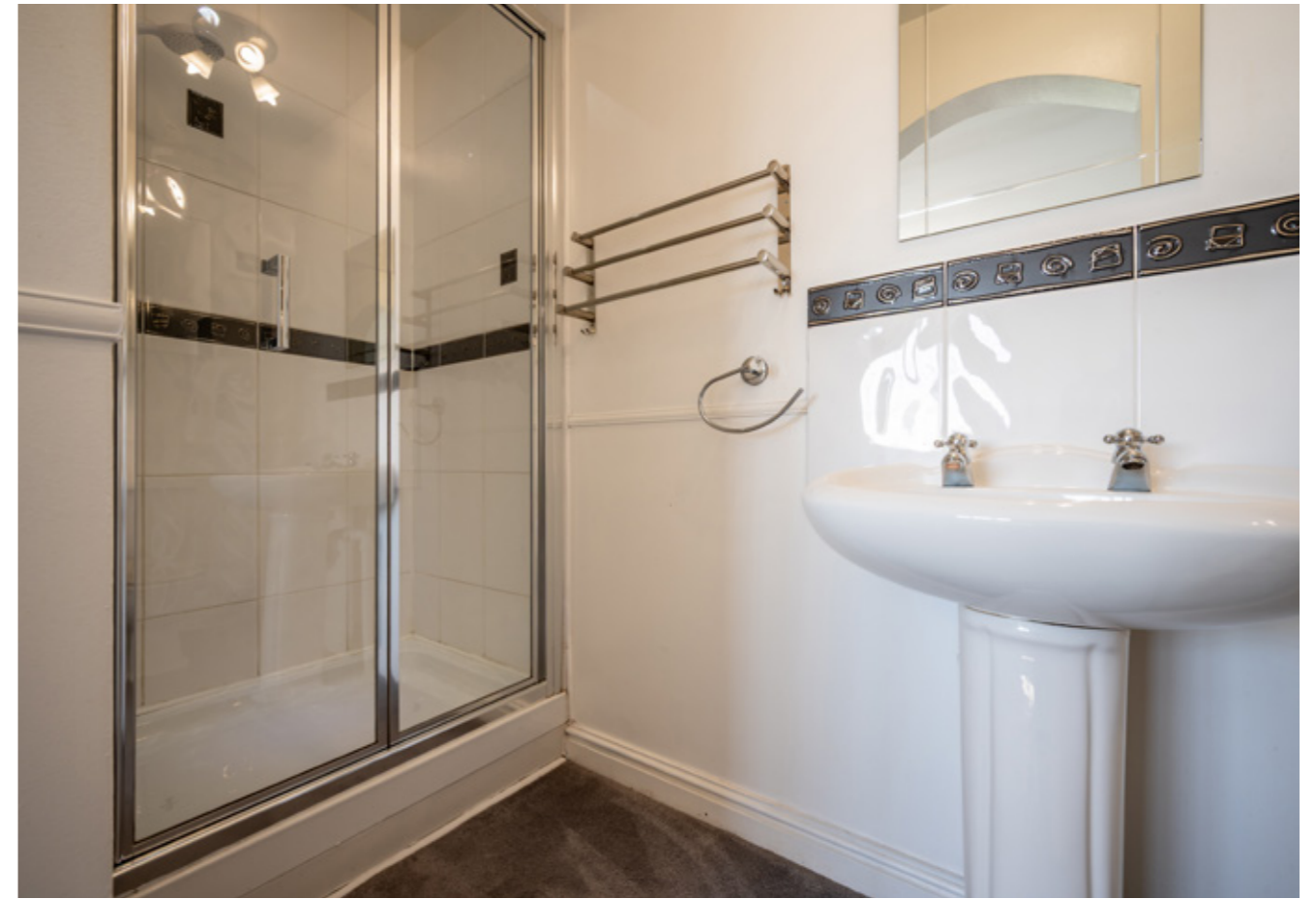
BEDROOM 2 EN-SUITE SHOWER ROOM