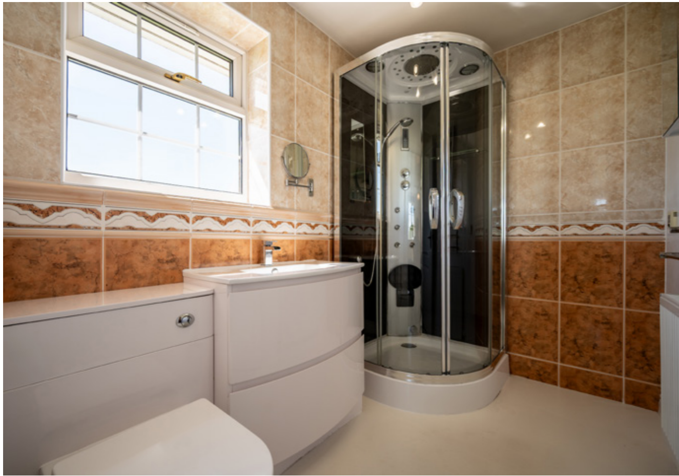
MASTER EN-SUITE SHOWER ROOM