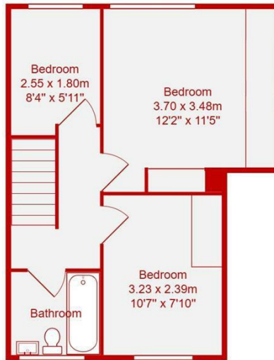
First Floor Area: 33.3 m 2 ... 358 ft 2

Total Area: 63.0 m 2 ... 678 ft 2 (excluding garage)