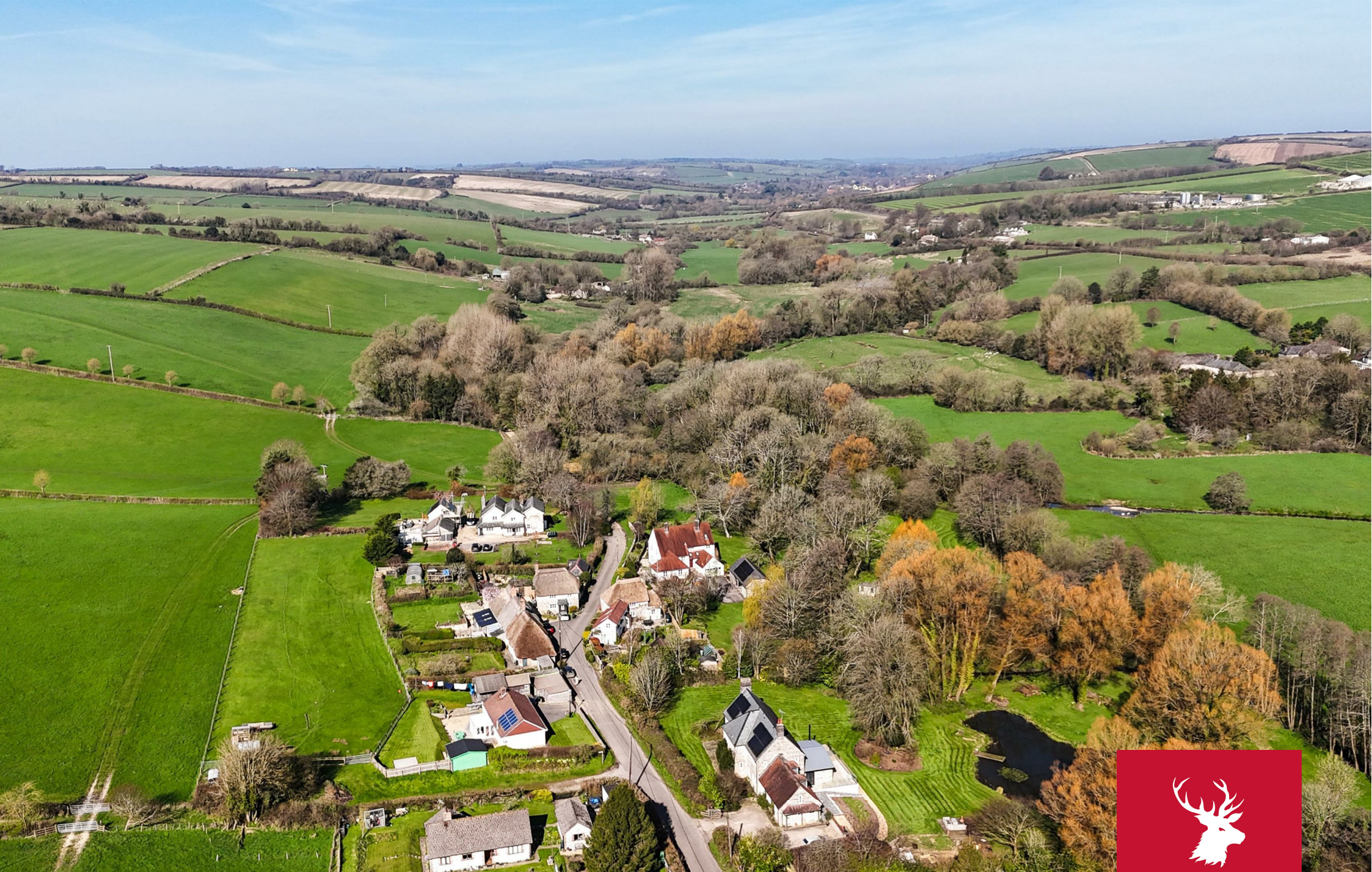
5 Southover Cottages, Southover