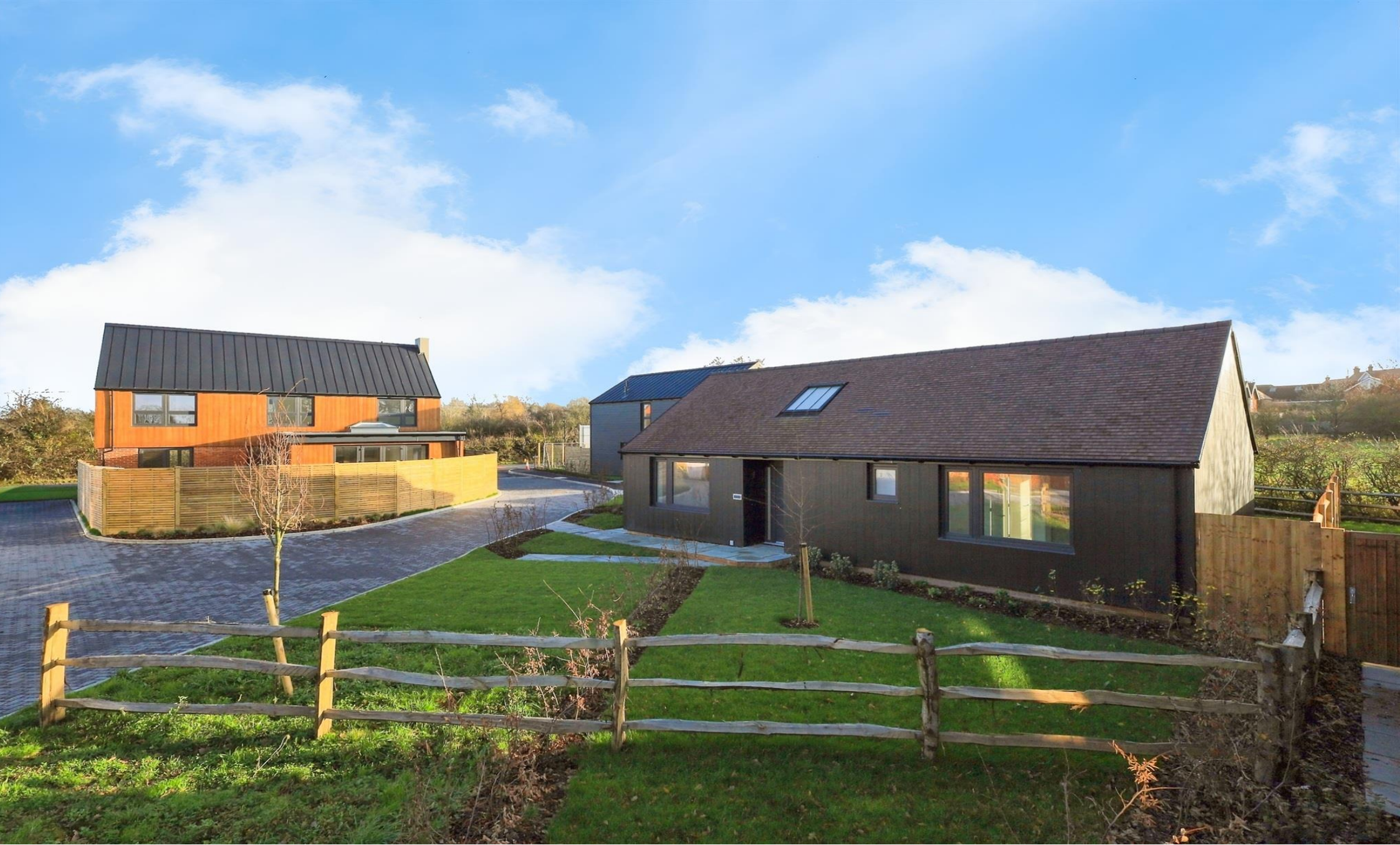
The Shire The Paddock, Upper Dicker Hailsham BN27 3RG