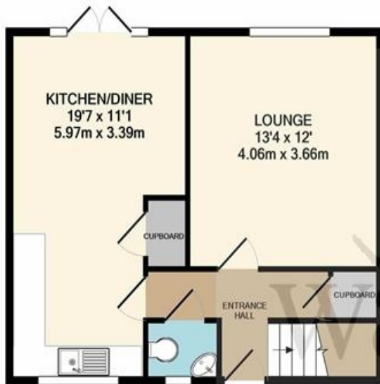
GROUND FLOOR APPROX. FLOOR AREA 453 SQ.FT. (42.1 SQ.M.)