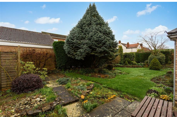
Warwick Close, Sheriff Hutton, York, YO60 6QW